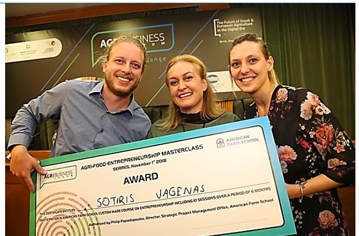
Hellenic Challenge : 2 nd Prize

C. The AgriBusiness Forum on 2-3 November 2018, a dynamic, professional, organic, networking conference focusing on a new generation of entrepreneurship by gathering and connecting the greatest exponents of Greek and European agriculture.