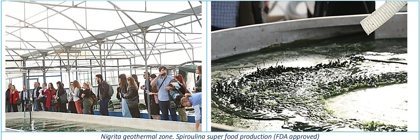
Nigrita geothermal zone. Spirulina super food production (FDA approved)

D. A field visit to Nigrita, showcasing its geothermal zone and its agricultural opportunities.