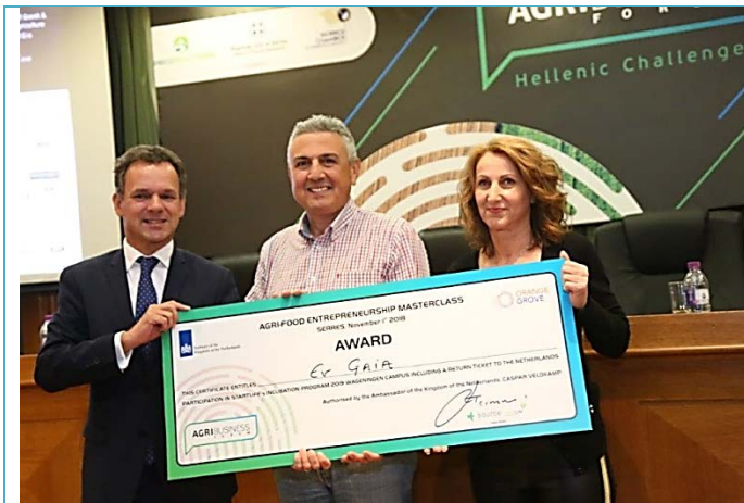
Hellenic Challenge : 1 st Prize